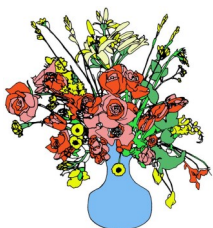
Flowers This Week